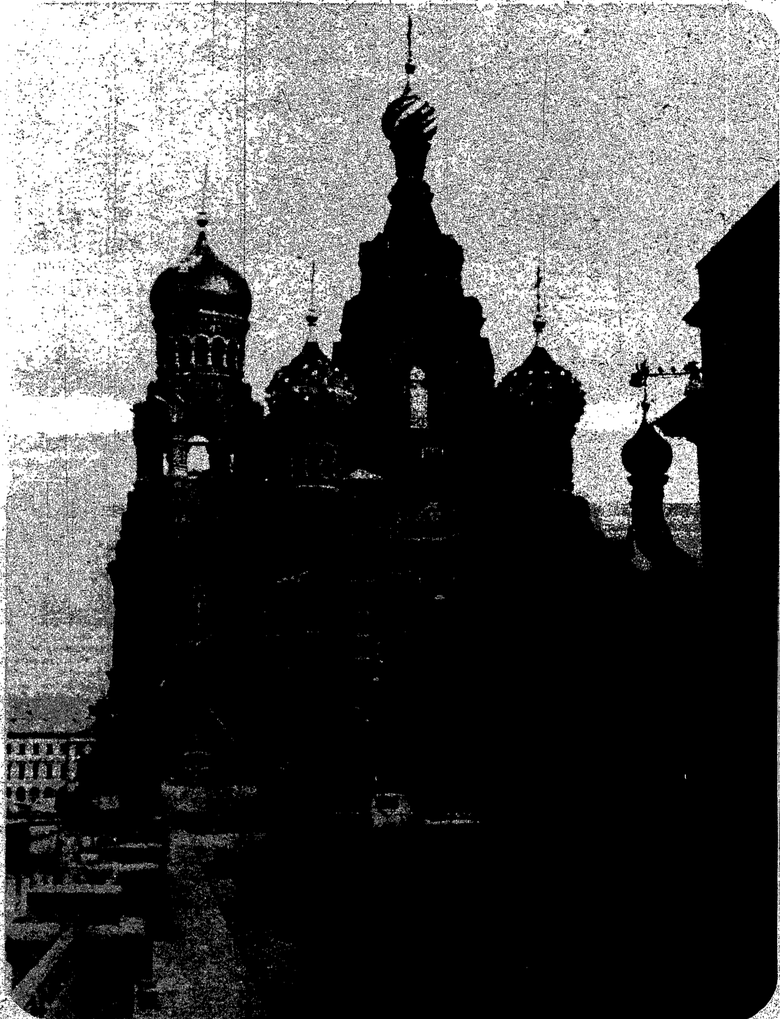
Redemption Cathedral in Leningrad was erected as a memorial to the assassinated 19th Century Romanov Czar, Alexander II. A replica of St. Basil's in Moscow, the structure is a masterpiece of Byzantine architecture. Its facade is delicately decorated with religious frescoes while its ornate spires are accented with a kaleidoscope of multi-colored and gracefully designed domes.