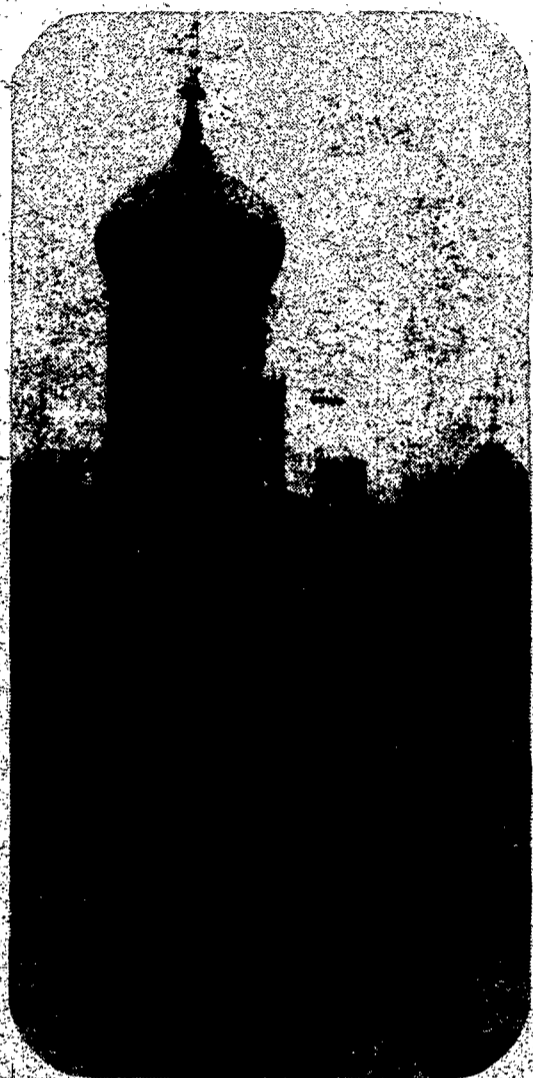
Typical of the ancient Russian Orthodox churches which abound throughout Moscow. There are 600 churches in the city out of which, according to Soviet guides, 40 are functional. The remaining ones are being restored as museums. Russian churches are not equipped with pews or chairs so worshippers either stand or kneel for services.