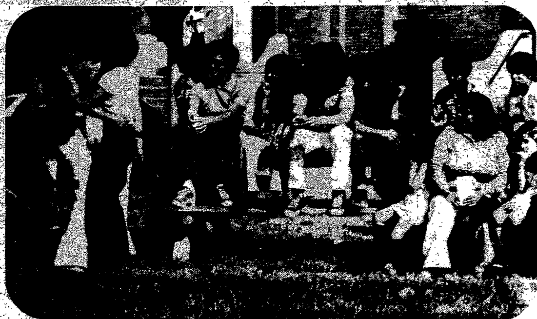
The green grass made a nice dance floor, but most chose to sit it out.

Carried by the sun during the procession the Queen Ortiz and the American flag.