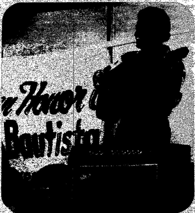
Good music was provided throughout the day.