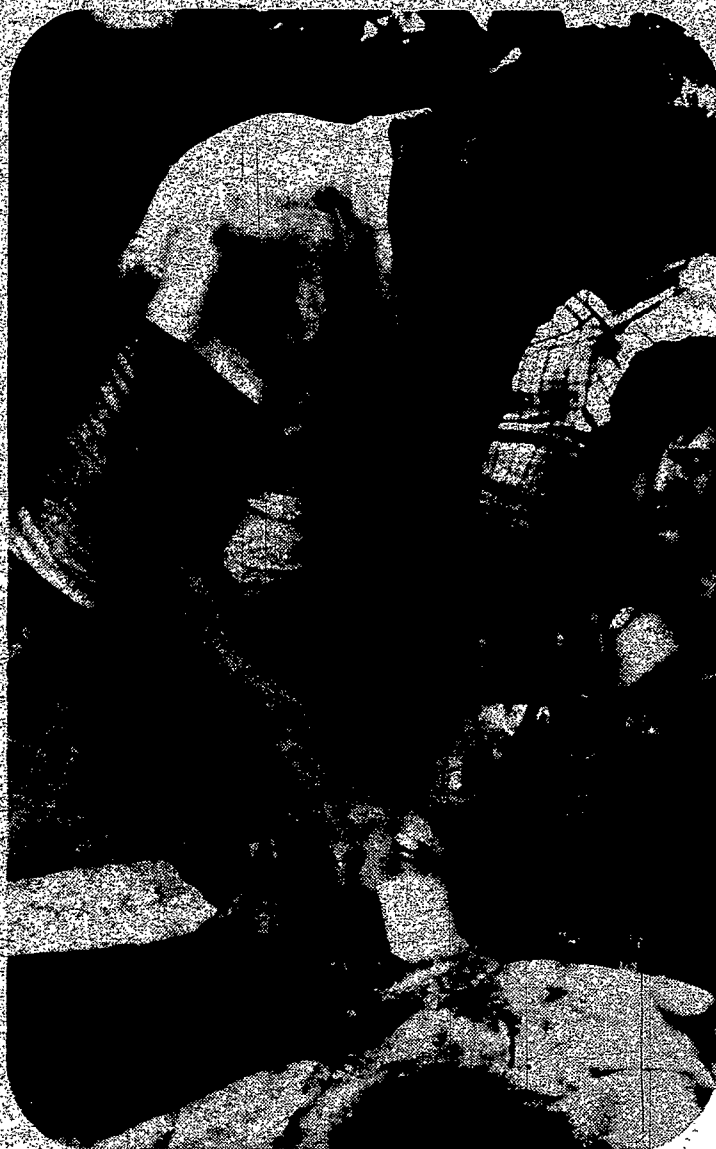
Making flavored ices involves scraping the ice by hand, an old-fashioned touch much appreciated by the kids on this hot summer day.