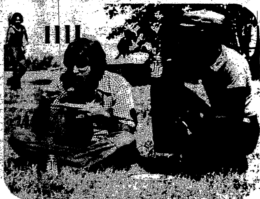
One of the best things to do at any celebration is to eat and drink — and chat with friends between mouthfuls.