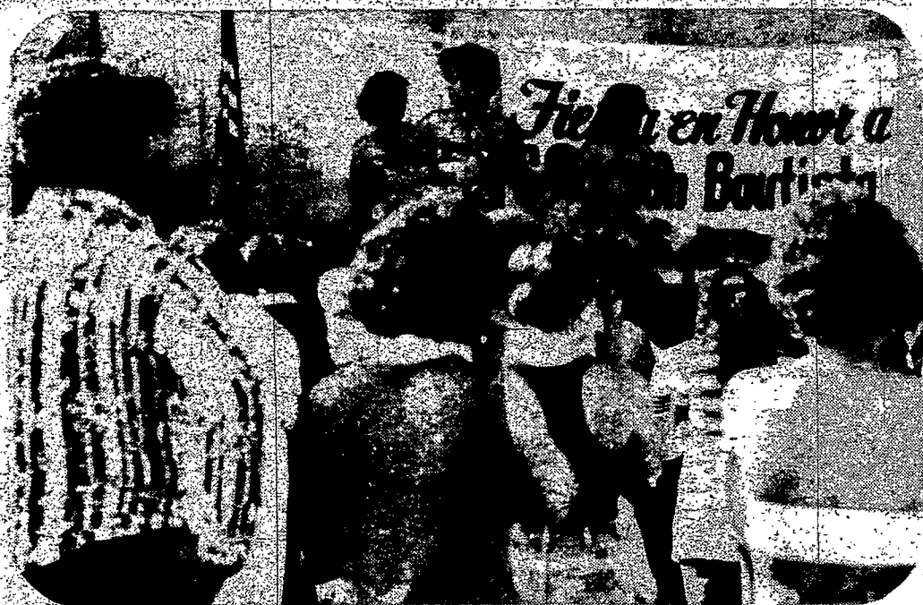
A number of dances were performed by "Hermanas Latinas."