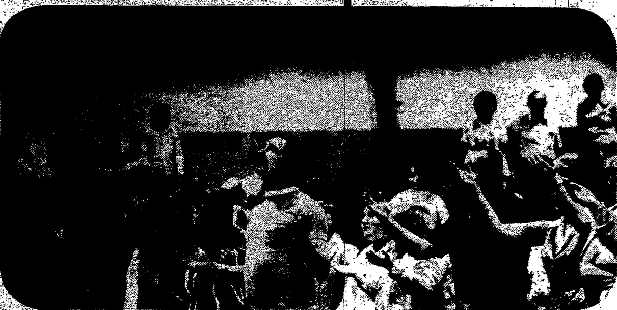
Prayer rings through the hall

Shortly thereafter music director for the event