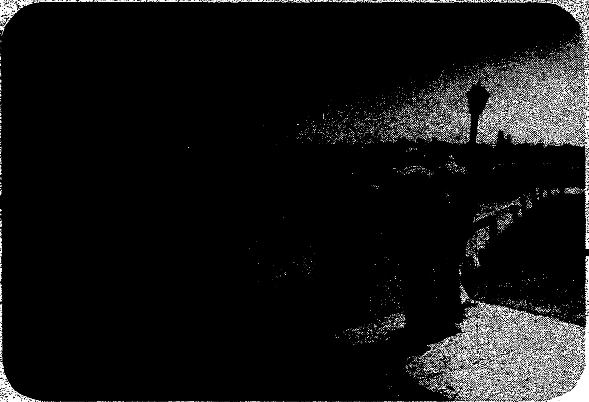
Leaving the fellowship luncheon