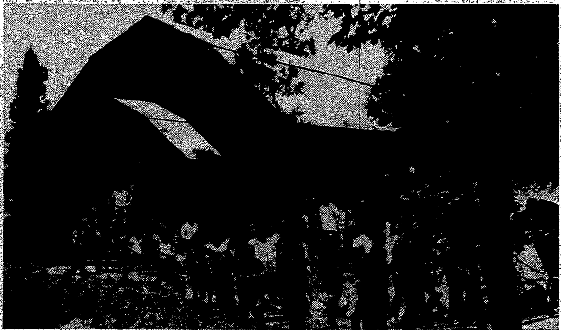
Camp Stella Maris

Congratulations to Camp Stella Maris on its 50th Golden Anniversary