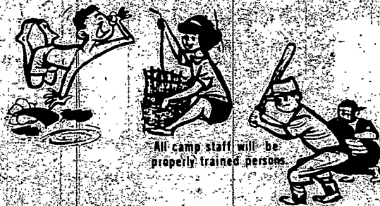
All camp staff will be properly trained persons.