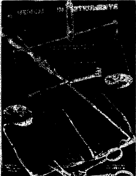
Medical instruments from the colonial era.