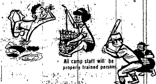
All camp staff will be properly trained persons.

Beatles they talked most about even though they were only eight and nine years old at the time of Beatle stardom.