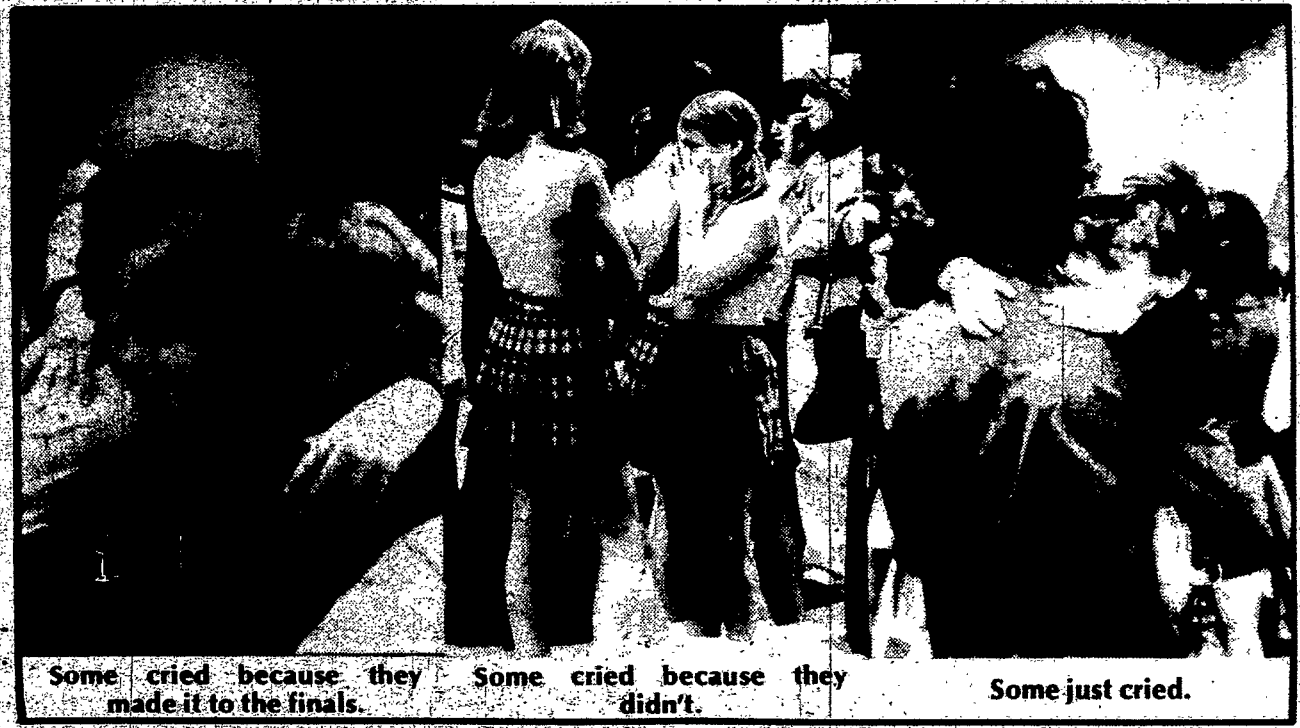
Some cried because they made it to the finals.