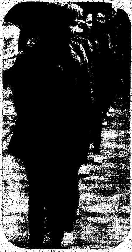
St. John's of Spencerport.