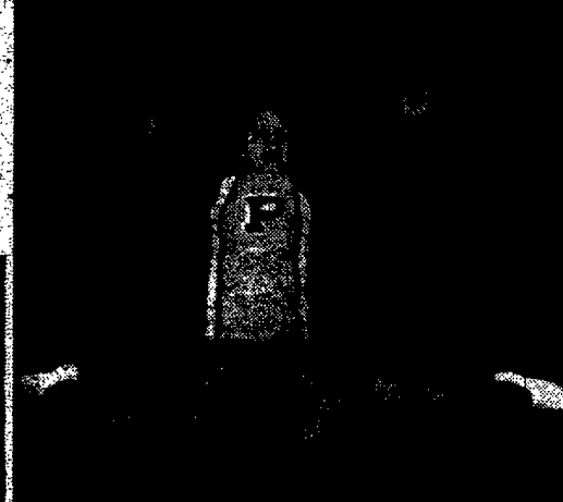
The competition was furious, yet feminine. The above block of photographs were taken during the actual competitions. The judges stressed general appeal, such as neatness and en-