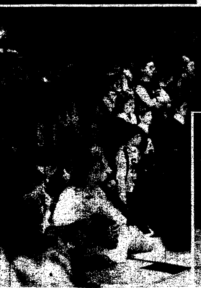
The girls watched each other compete to get a better idea of where they stood. Still, the judge's announcements brought screams of happiness, as well as tears of sorrow.