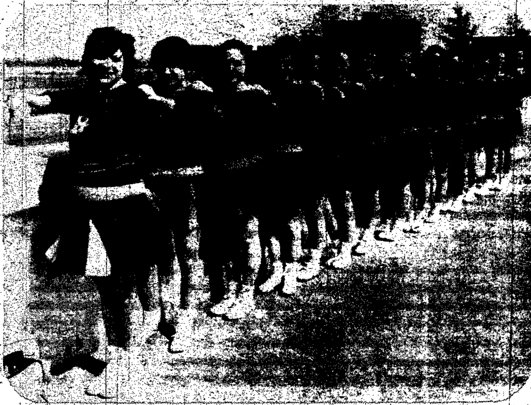
They came from near and far. Above, Holy Cross of Rochester.

It was sunny and warm; the competition was fierce; there were hundreds of cheerleaders. It sounded like thousands. The crowds were large and enthusiastic. There was so much action, the competition was held in two gymnasiums simultaneously. Emotions ran high among competitors and their "cheerleaders" in the stands. In an effort to produce a picture series which reflects the events of the day, photographs have been culled from both competitions. Read the series clockwise around the main photo.