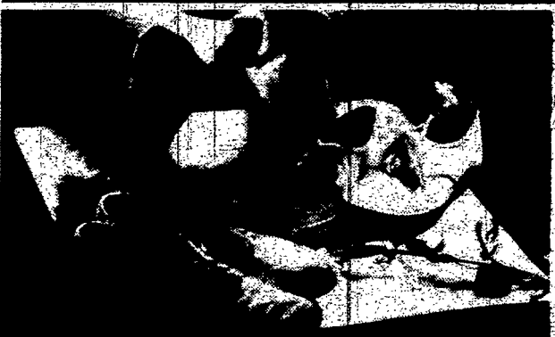
The cheering is over. The eardrums cease their pounding, the flowers wilt, and the feet rest.