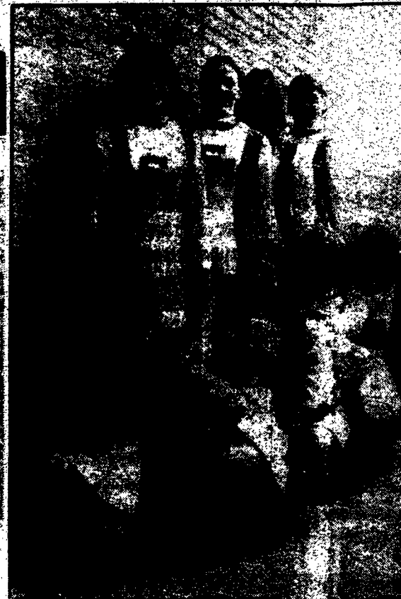
Sacred Heart of Auburn.