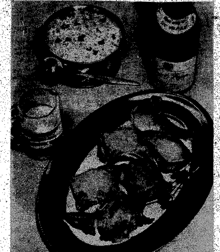
PORK CHOPS bathed in a silky cream and white wine sauce are served with fluffy rice and a charming white St. Veran Burgundy imported by Austin, Nichols & Company. Novelty stores offer porcelain tags you can inscribe yourself for your wine bottles.