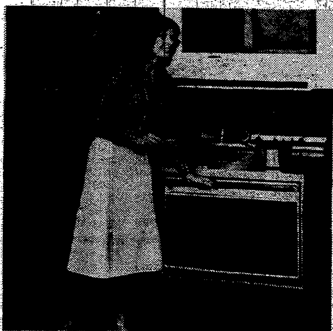
BLACK GLASS ADDS CLASS to the remodeled kitchen and it's now available again in two new drop-in ranges from Hot-point. With the added elegance of brushed-chrome cook tops and handsomely redesigned backslashes, these electric ranges complement almost any kitchen decor. Both standard and self-clean ovens are available behind the full-width tempered glass doors, and the two-step surface unit controls provide the flexibility of infinite heat settings.