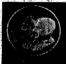
Medallion on stand P101 $6.95

Add $1.00 per unit for postage & handling. Note: Pennsylvania residents add 6% state sales tax. *also available in gold or silver, write for details.