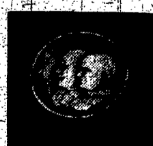
Medallion on slate P107 $16.95