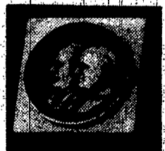
Medallion on marble P106 $10.95