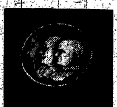
Medallion on slate P107 $16.95