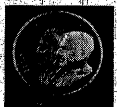
Medallion on stand P101 $6.95

OFFICIAL SYMBOL OF THE 41ST INTERNATIONAL EUCHARISTIC CONGRESS This official symbol appears on each Medallion indicating that it is an officially recognized memento of this great occasion.