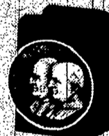
Medallion letter holder P105 $7.95