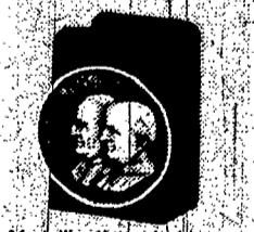
Medallion letter holder P105 $7.95

Add $1.00 per unit for postage & handling. Note: Pennsylvania residents add 6% state sales tax. *also available in gold or silver, write for details.