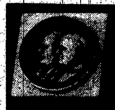
Medallion on marble P106 $10.95