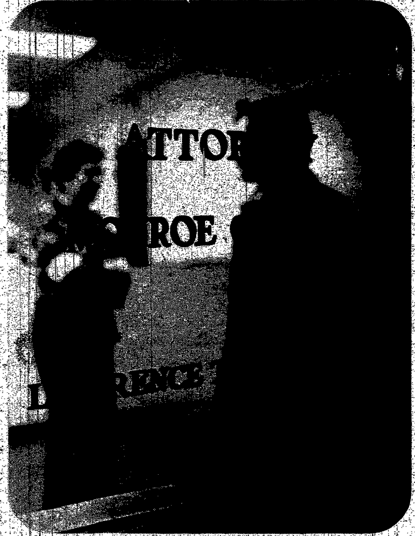
The center will work with the District Attorney, helping witnesses and victims prepare to testify.