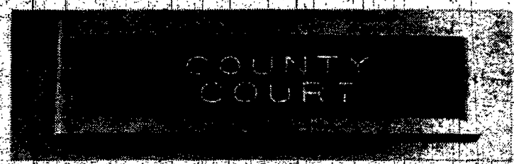
The various court rooms located in two different buildings can be confusing to a witness who has never had any dealing with the criminal justice system.

Text by Martin Toombs