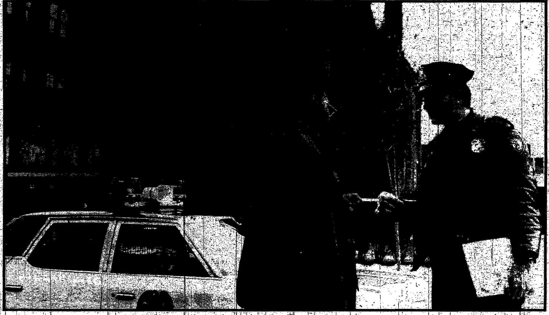
The investigating officer will be important to the success of the program, as he can refer victims and witnesses to the assistance center for help.