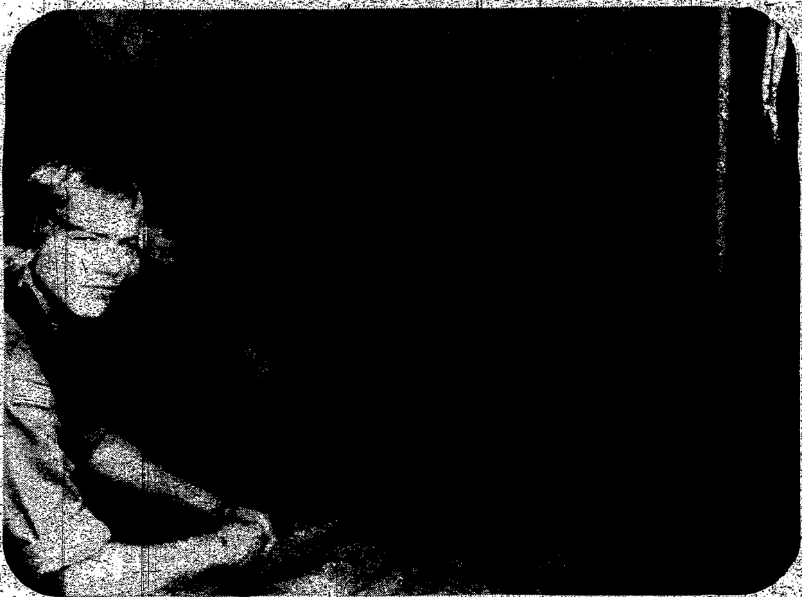
We are tenting tonight on the St. Bernard's Seminary grounds.