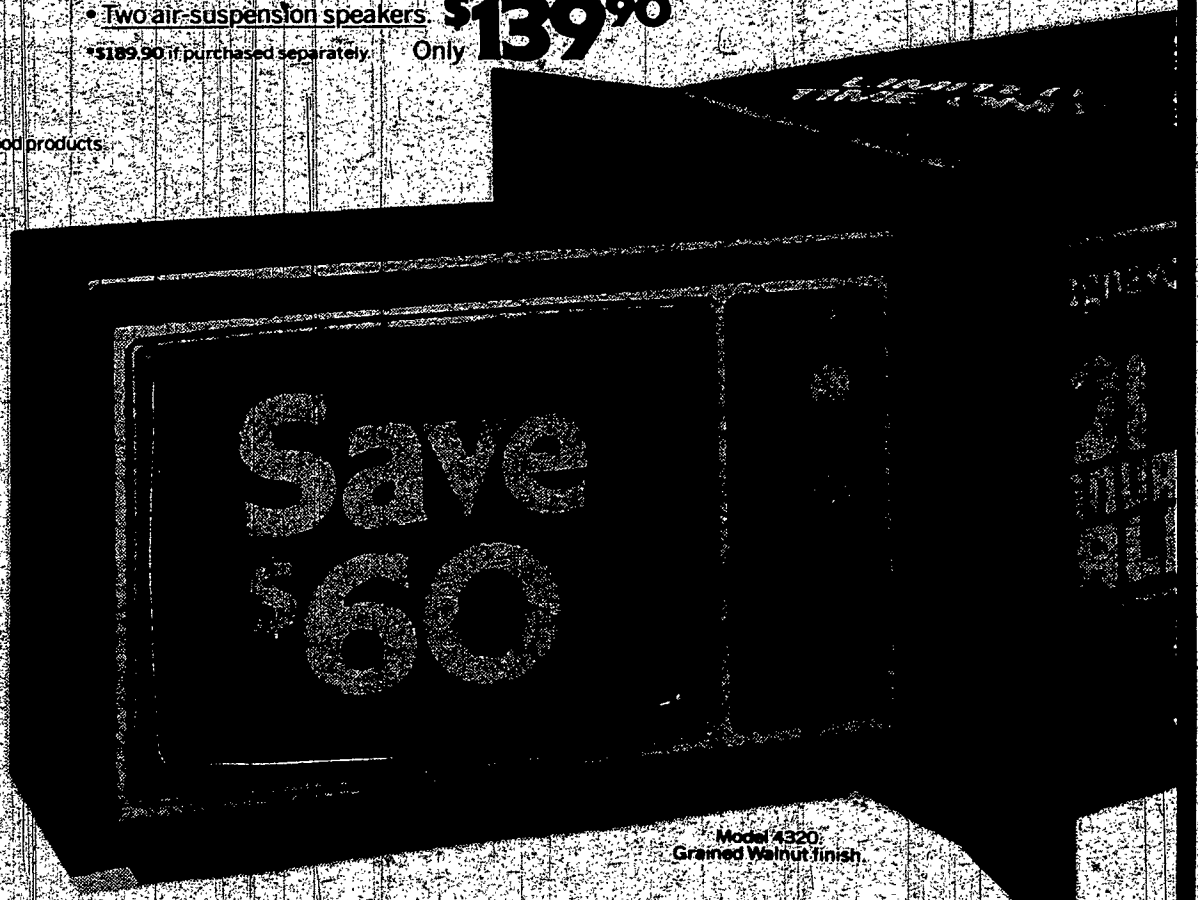
Model 4320. Grained Walnut finish.