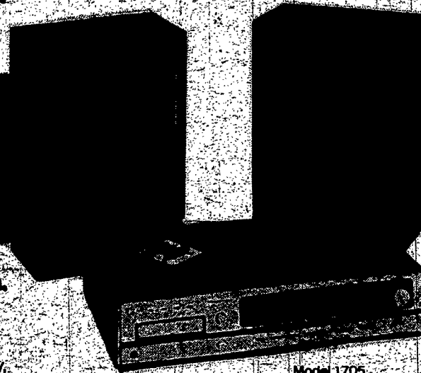
Model 1705. All units of non-wood material.