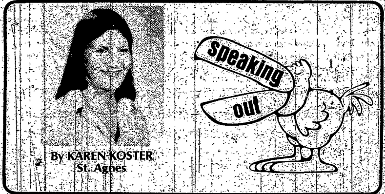
By KAREN KOSTER St. Agnes

Inconsideration is one of the major problems in this world today.