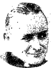
Fr. Andrew Greeley

The Third World revealed its moral ugliness in the recent anti-Semitic binge at the United Nations. The myth of the "people of the world" struggling for "liberation" went down the drain as the group of little Hitlers representing the oppressive military dictatorships (left and right) which dominate the Third World jumped on the anti-Semitic bandwagon.