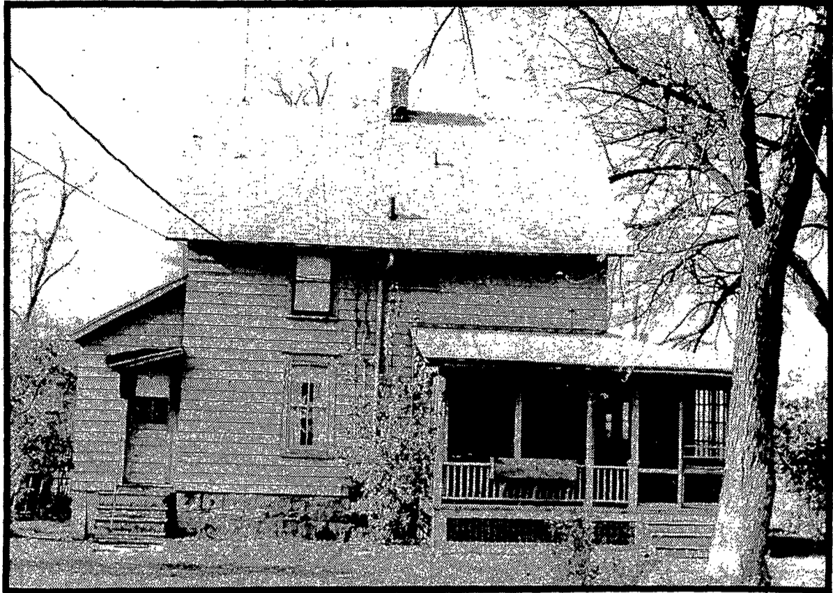
Repairs to this house enabled a mother and her daughter to move into a home of their own.