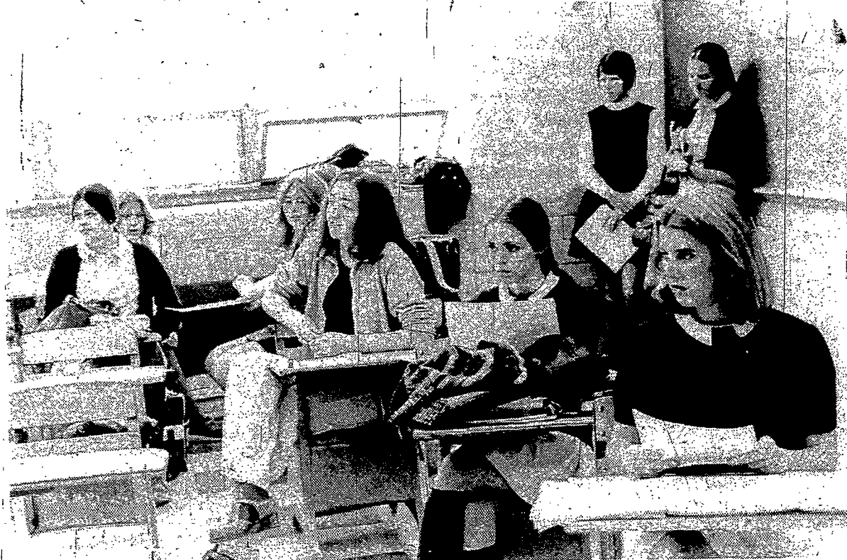
Students from St. Agnes and Mercy answered McQuaid's casting call for actresses. The girls studied their parts while they waited patiently to audition for the school's play, which will be presented at Mercy Dec. 4, 5, 6.