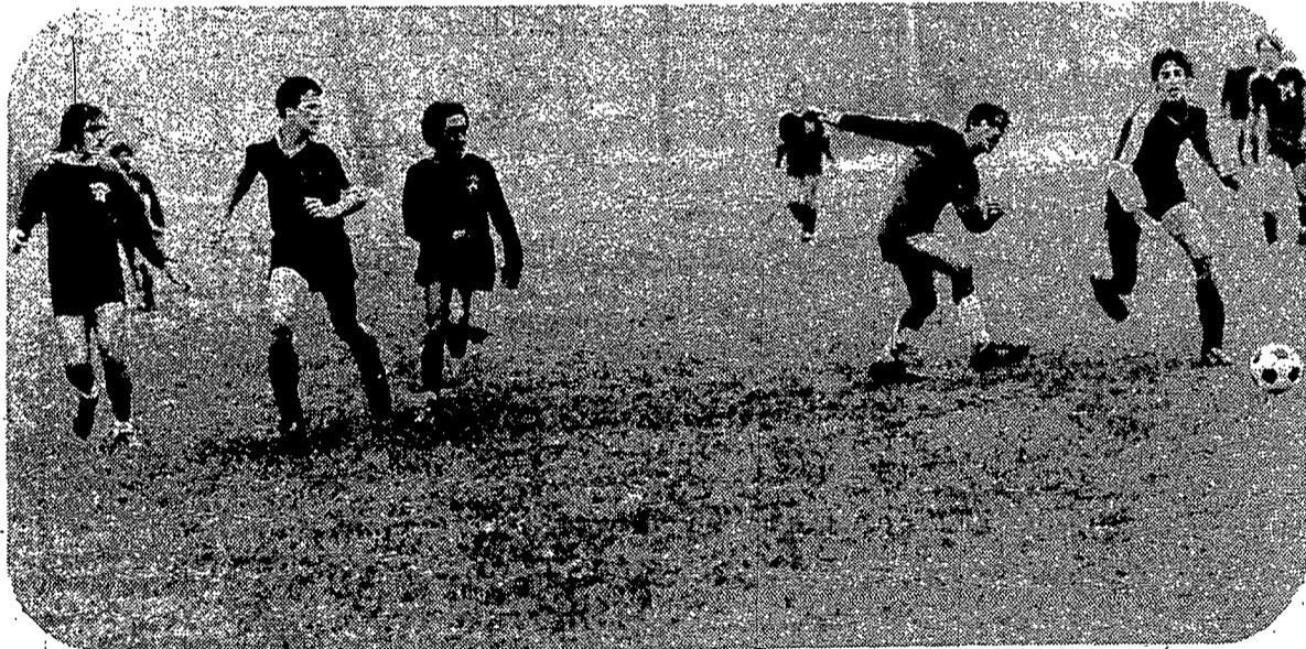
Soccer in the Rain

ST. AGNES: Wednesday, Sept. 24—Big and little sister day for freshmen. Thursday, Sept. 25—Parents Club dinner meeting. Wednesday, Oct. 1—NYS Regents Scholarship tests.