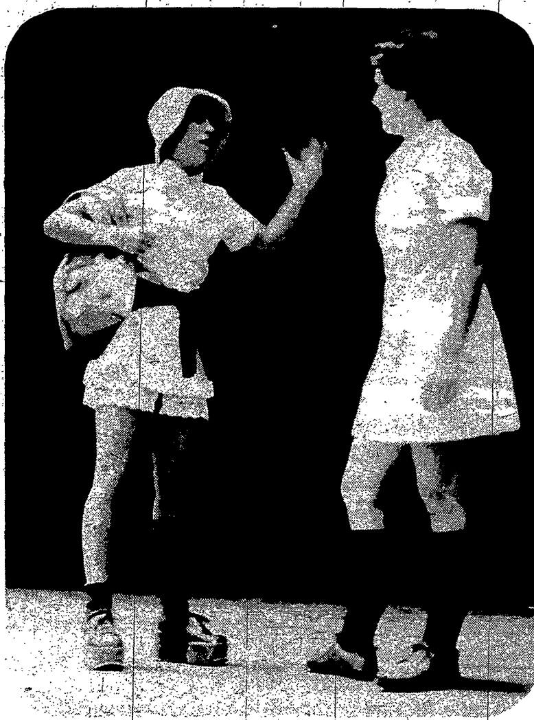
A junior portrays a nervous freshman as she tells her woes to a 'big sister" during skit put on by the juniors.