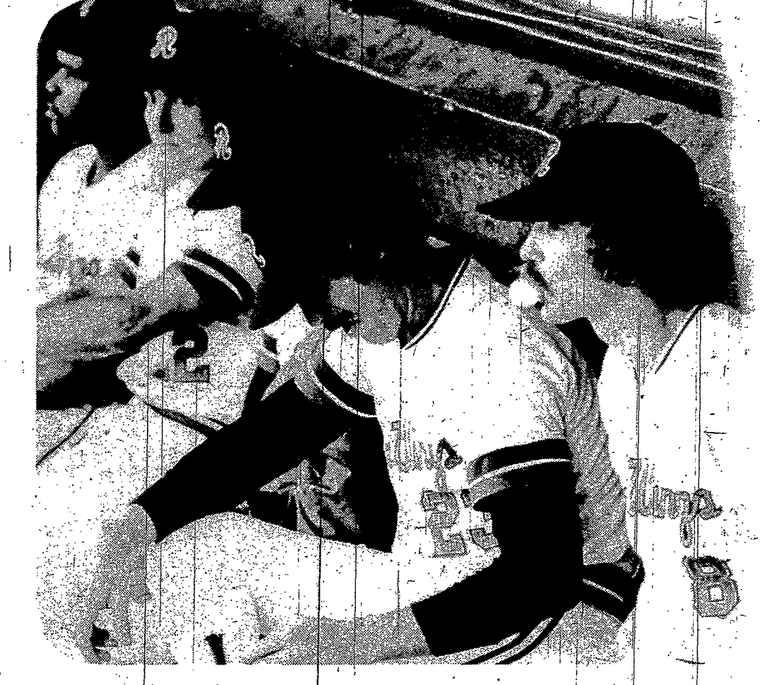
A bubble or two helps to relieve dugout tensions.