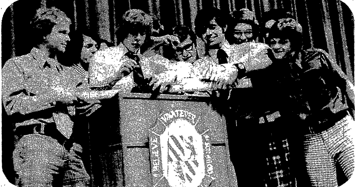
These Aquinas graduates aren't too anxious as they all reach for giant diploma. A bit premature in their enthusiasm as graduation isn't until Sunday, June 22.