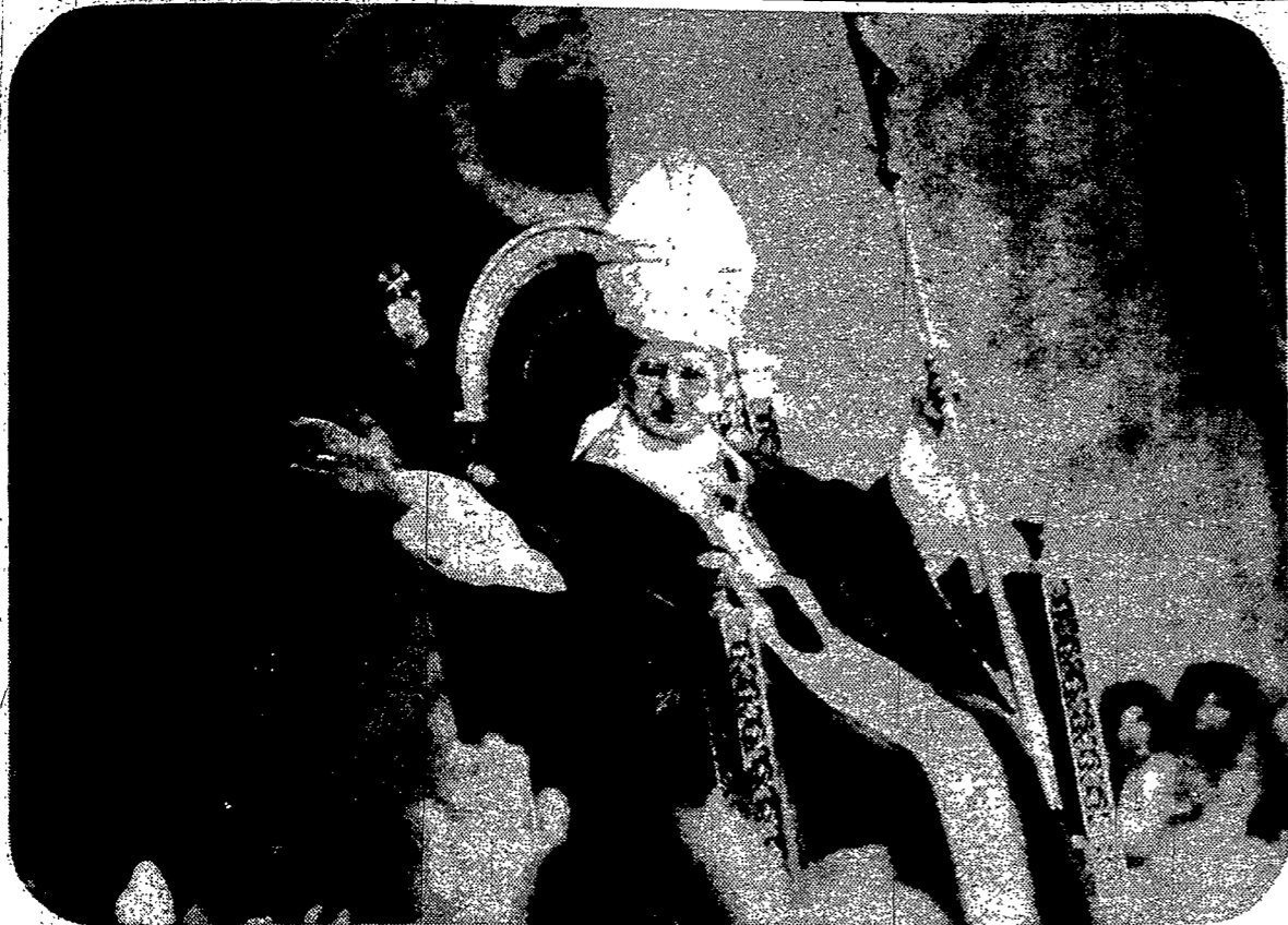
Pope Paul VI is borne into St. Peter's Basilica to celebrate a Mass which highlighted the conference.