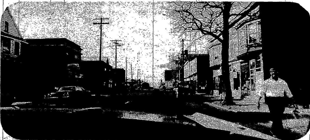
Cruising typical street . . .