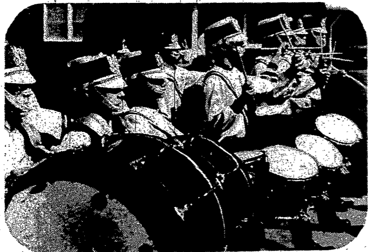
The Aquinas Marching Band's drum section in parade style.