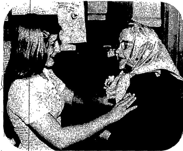
A gracious welcome.