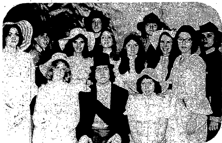
Little Mary Sunshine

The cast of the musical comedy, "Little Mary Sunshine" will present the play at Aquinas Institute, May 16-17.