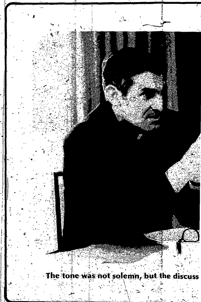
The tone was not solemn, but the discuss