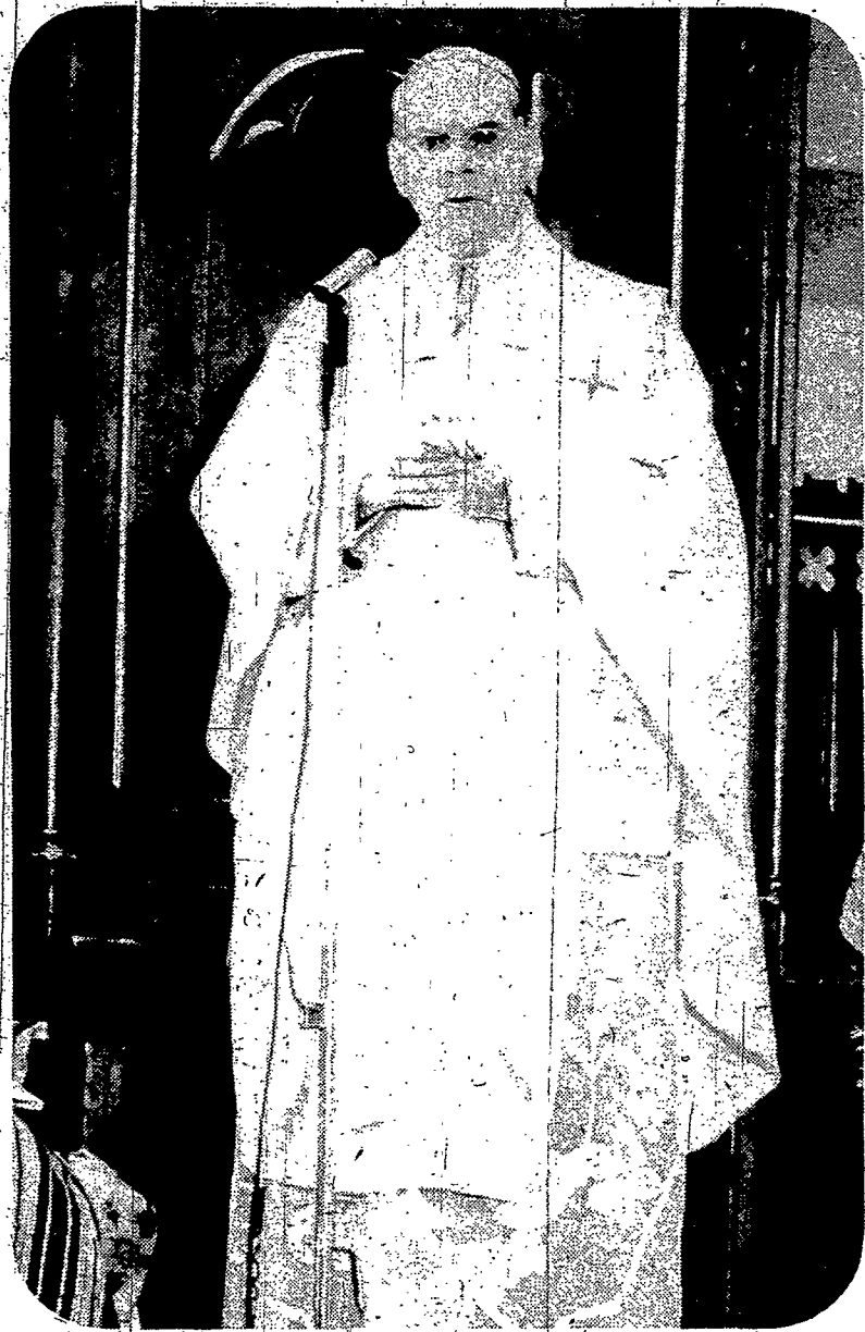
Cardinal Terence Cooke delights crowd at the Cathedral with relaxed talk praising the warmth of his welcome in Rochester as well as the work of diocesan and Cathedral personnel.