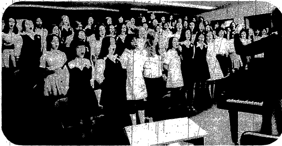
St. Agnes High School Glee Club working hard preparing music for concert tour.