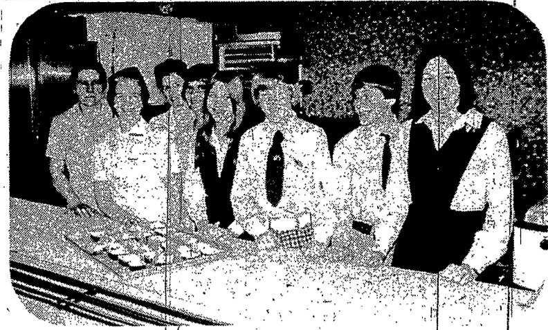
St. Pius Dinner