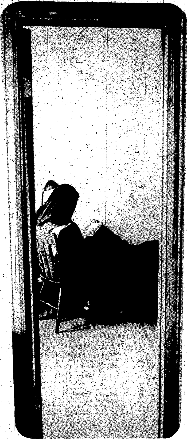
Each Carmelite nun has her "hermit's cell," where she is shielded from distractions.