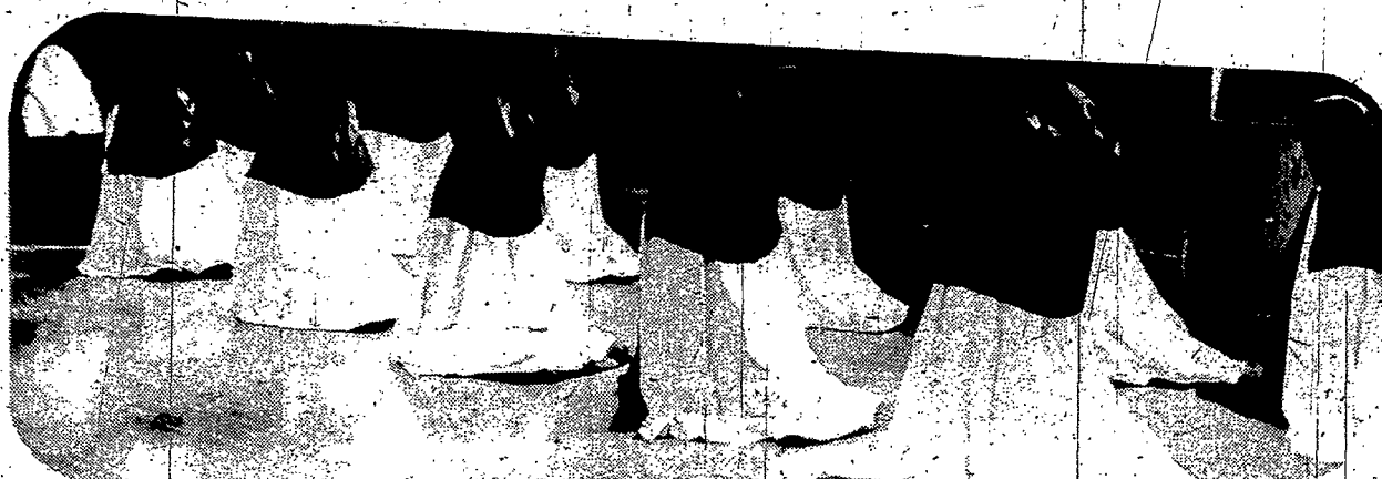
From time to time, all come together in the chapel. Here, they are wearing white, for Sunday.