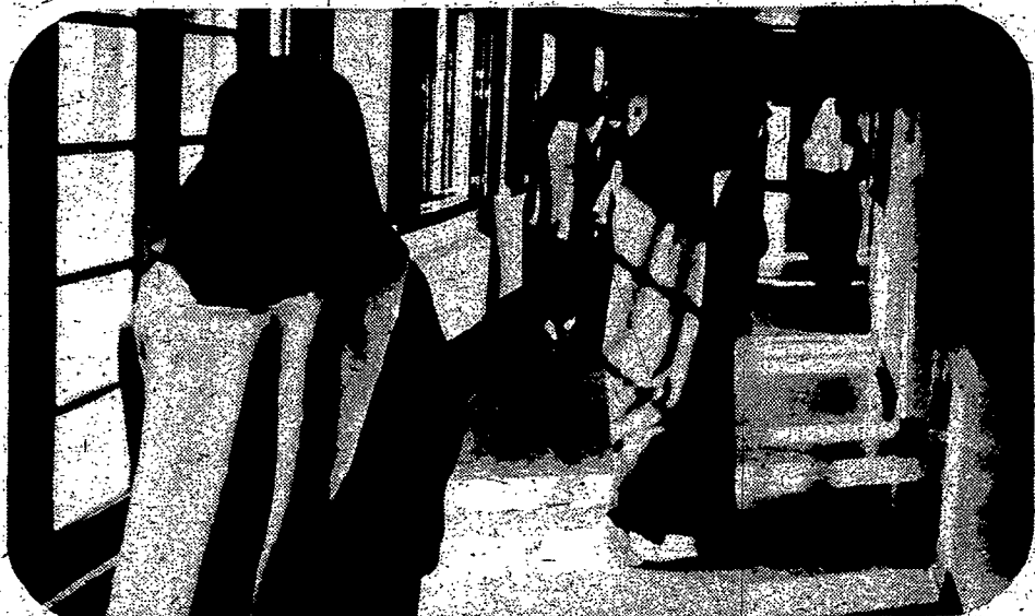
The quiet is undisturbed as they skim down a corridor in soft shoes.

Let Nothing Disturb Thee. Let Nothing Affright Thee. All Things Are Passing. God Only Is Changeless. Patience Gains All Things. Who Hath God Wanteh Nothing - Alone God Sufficeth.