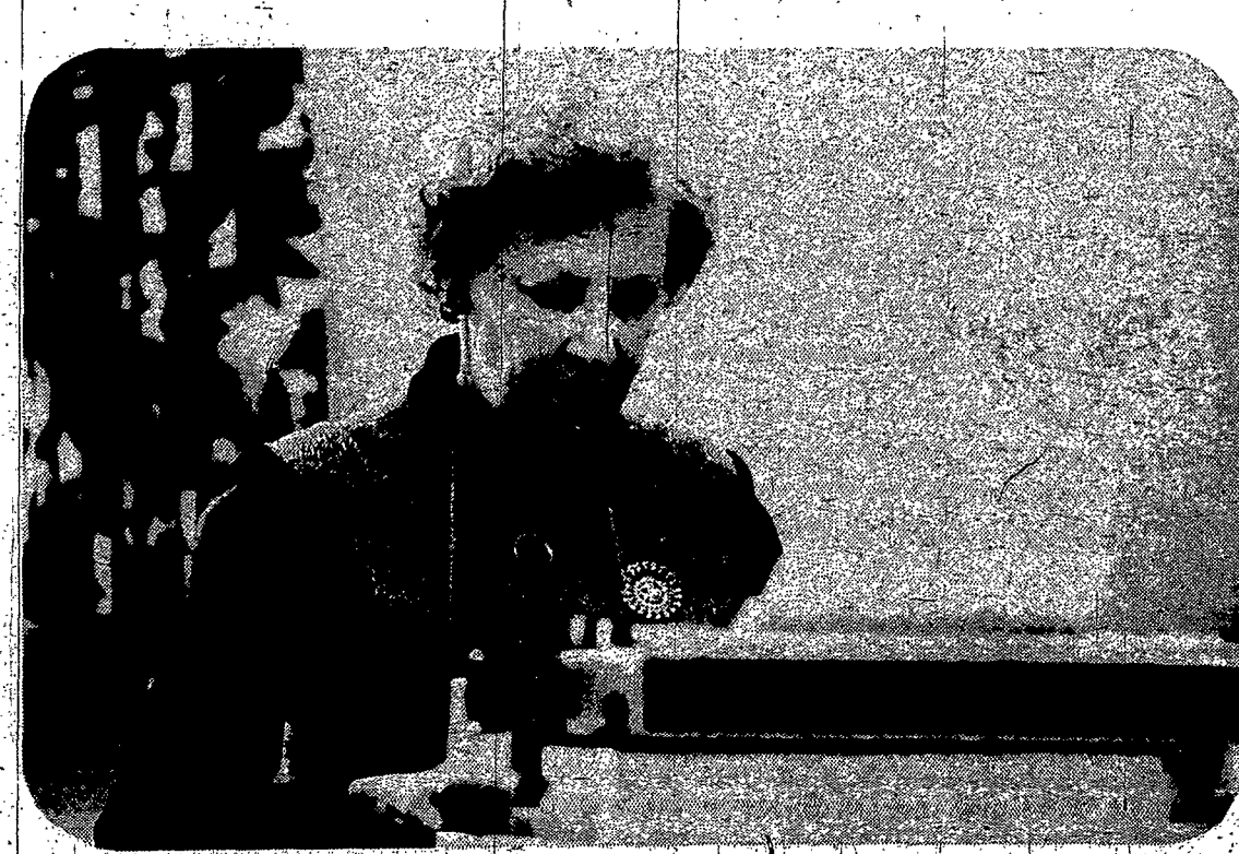
Returning to work after many years, often part of widowhood, can be extremely difficult