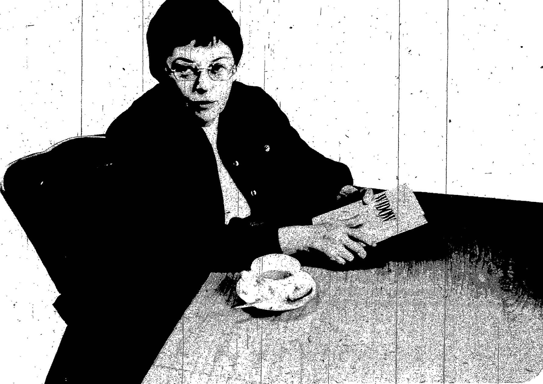
Reading can help a widow adjust and grow.