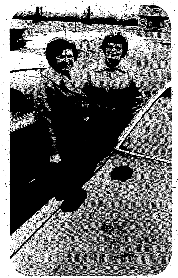
Friendships with other women deepen after a husband's death.