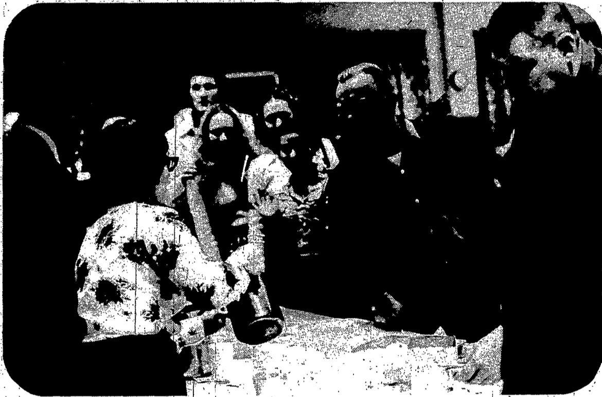
After the evening show, residents were invited to join members of the hospital staff, the knights and entertainers for coffee and cookies served by the Bath K. of C.