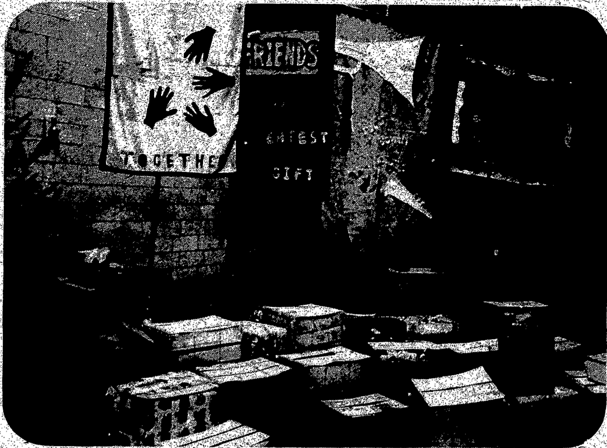
Colorful banners proclaimed their joyful Christmas messages while the gifts of food told of McQuaid students' sharing. Food baskets will be given to needy.