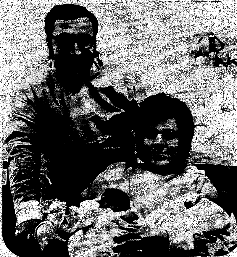
Piazzas and the newcomers.

their new family but it has presented some immediate difficulties. For instance, does anyone have an extra crib? Or