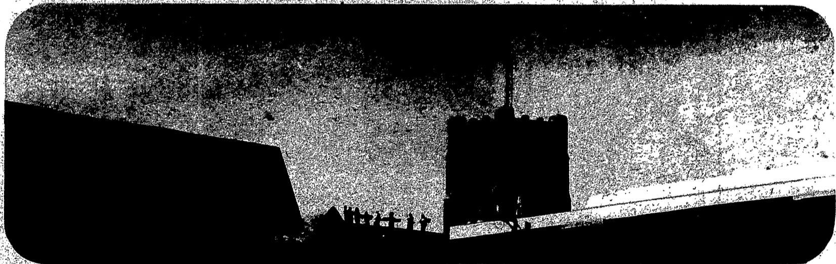
Nazareth College's Brass Ensemble climbed to the roof of Smyth Hall to give their anniversary day concert. The photo above shows the group as they appeared from across campus.

Aspects of the "flourishing tree" in Pittsford were photographed during the 50th birthday party for college and community, and the alumnae's "Focus Fifty" week in October.