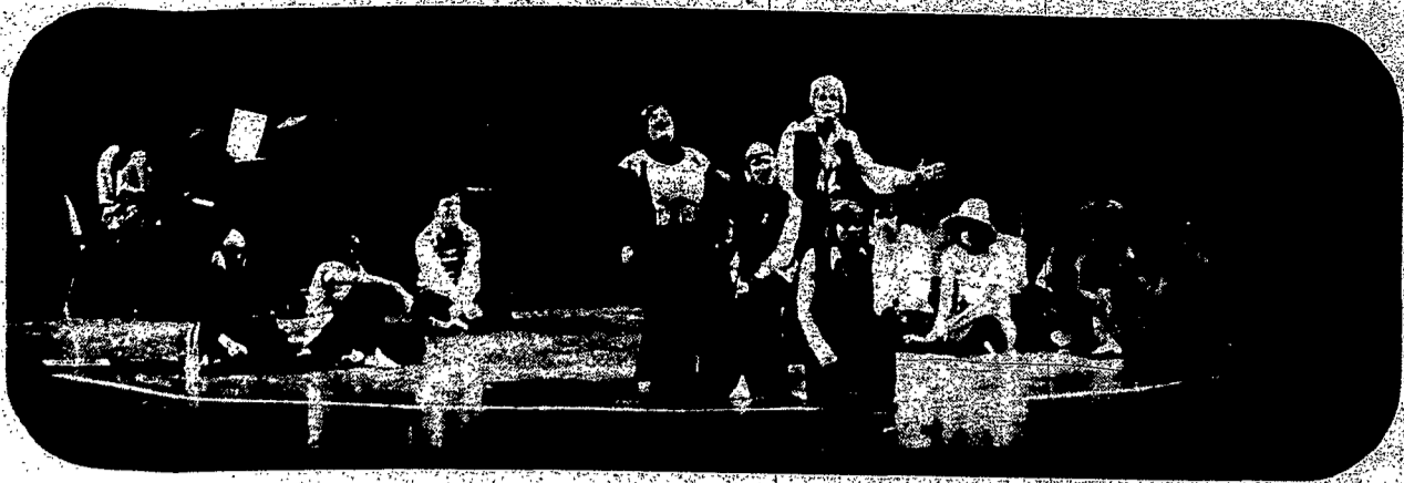
A group of students show off their talent during Anniversary Day presentation of 50 years of musical theater.