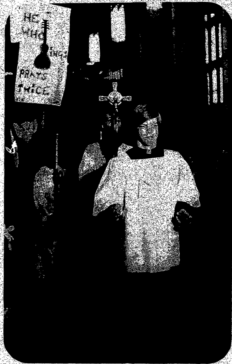
Procession enters cathedral.