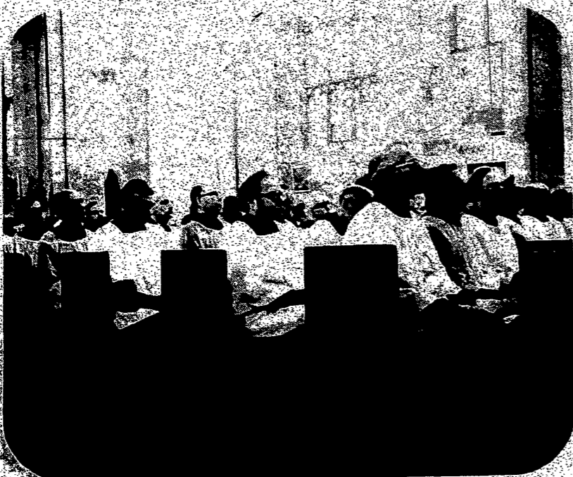
The clergy attends.