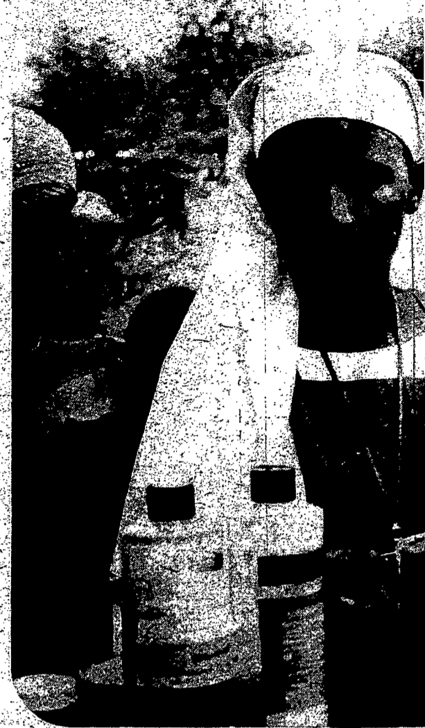
A Ghanian nun supervises medical