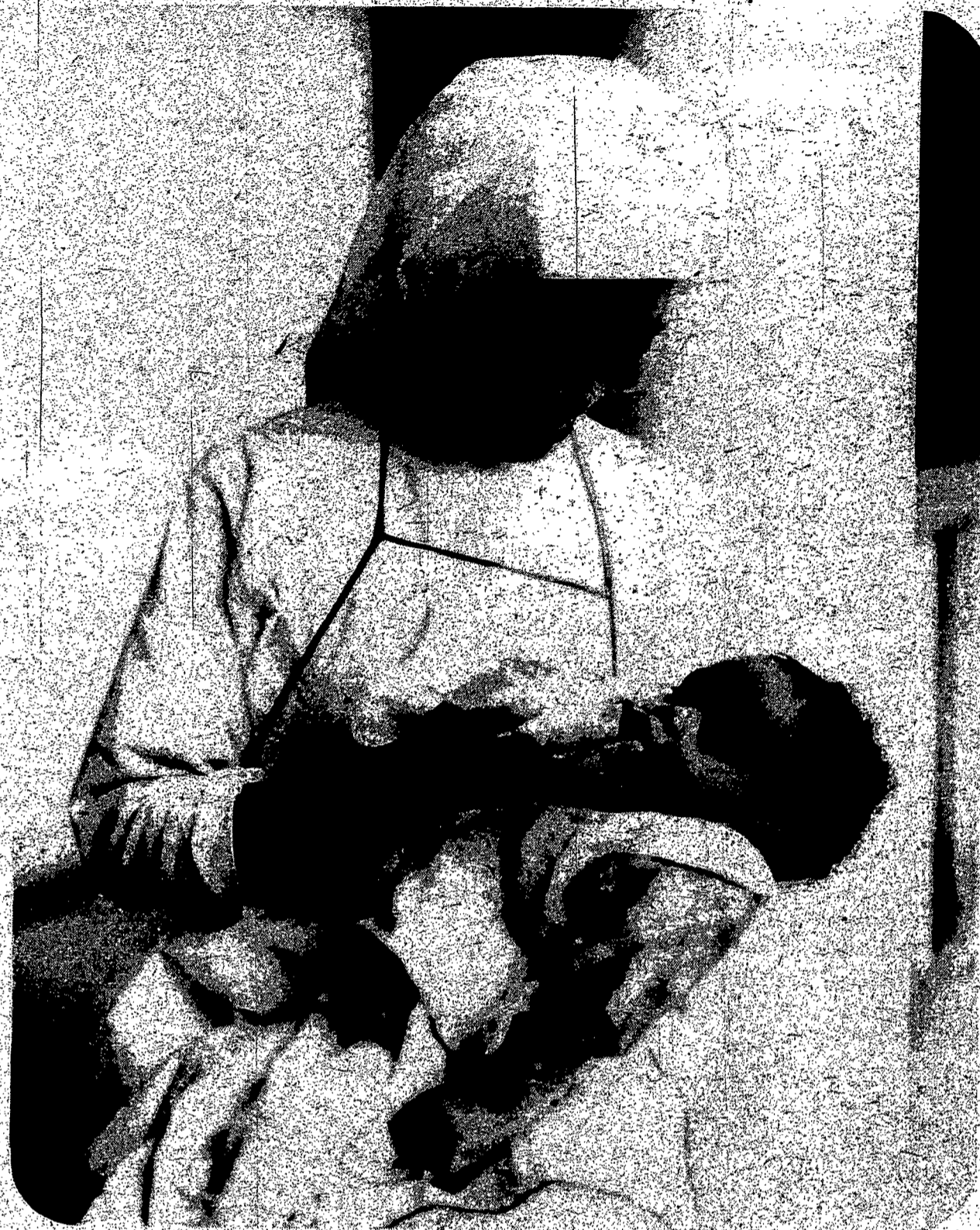
The role of the missionaries is two-fold — spiritual and physical. Their work witnesses the truth that all people are children of God and have a dignity and a destiny. Your assistance will help support thousands of native-born Sisters and mission seminarians who will bring this message to their countrymen.