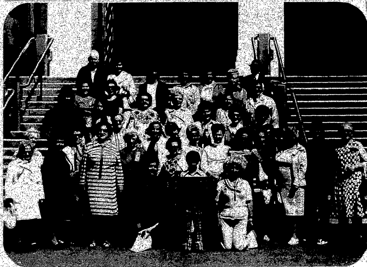
Pilgrims to Canada