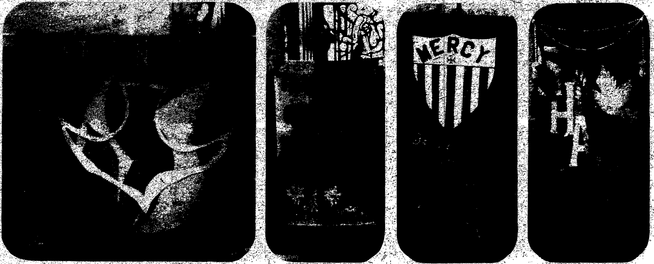
Banners represented each Mercy house at the Sunday Eucharist.