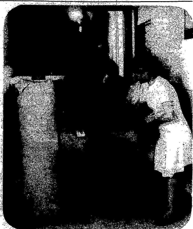
Volunteers from the inner city parishes and the Lewis Street Center play their own form of "pass the buck." In this endeavor, books, desks and school supplies are being passed as the contents from St. Bridget's school are transferred to St. Michael's.