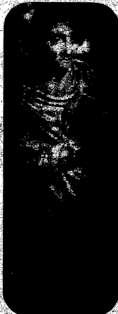
Except for his legs which have crumbled away this shepherd boy is still in good shape.