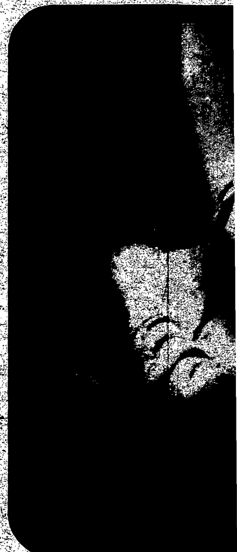
The Carrying o