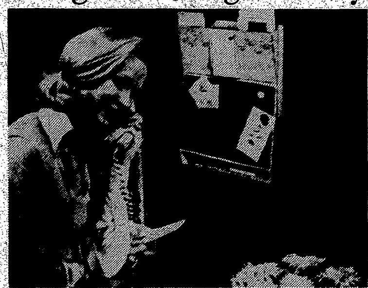
BUSY DAYS DEMAND an organized and efficient way to communicate with all members of the family. This message center enables you to do just that within a small amount of space Bills, phone messages and reminder notes can now be handled in an organized way to eliminate clutter and keep things at your finger tips.

swer to running a home smoothly even down to the