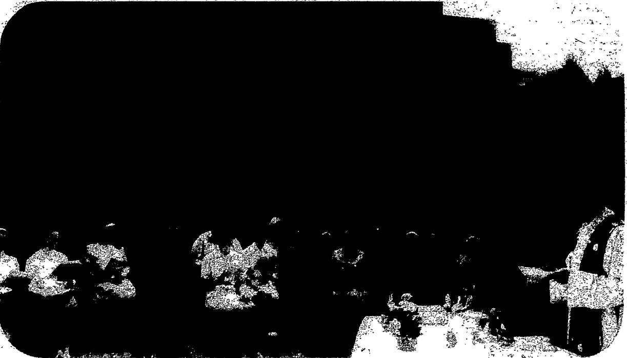
A Garden Mass