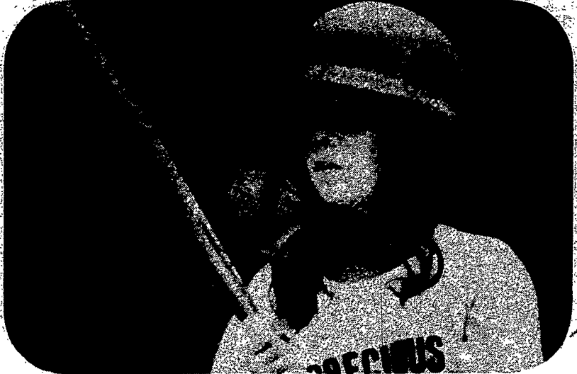
Back at Bat

A scene from the annual Hill Cumorah Pageant depicts the appearance of Jesus Christ on the American continent following his resurrection and ascension. The pageant, entitled "America's Witness to Christ," is presented by the Church of Jesus Christ of the Latter-day Saints. The cast of 600 Mormons will perform July 26, 27, 30 and 31 and August 1-3 at 9 p.m. on the hillside theater in Palmyra. The event is free. The appearance of Christ in the Americas is a tenet of Mormon belief.