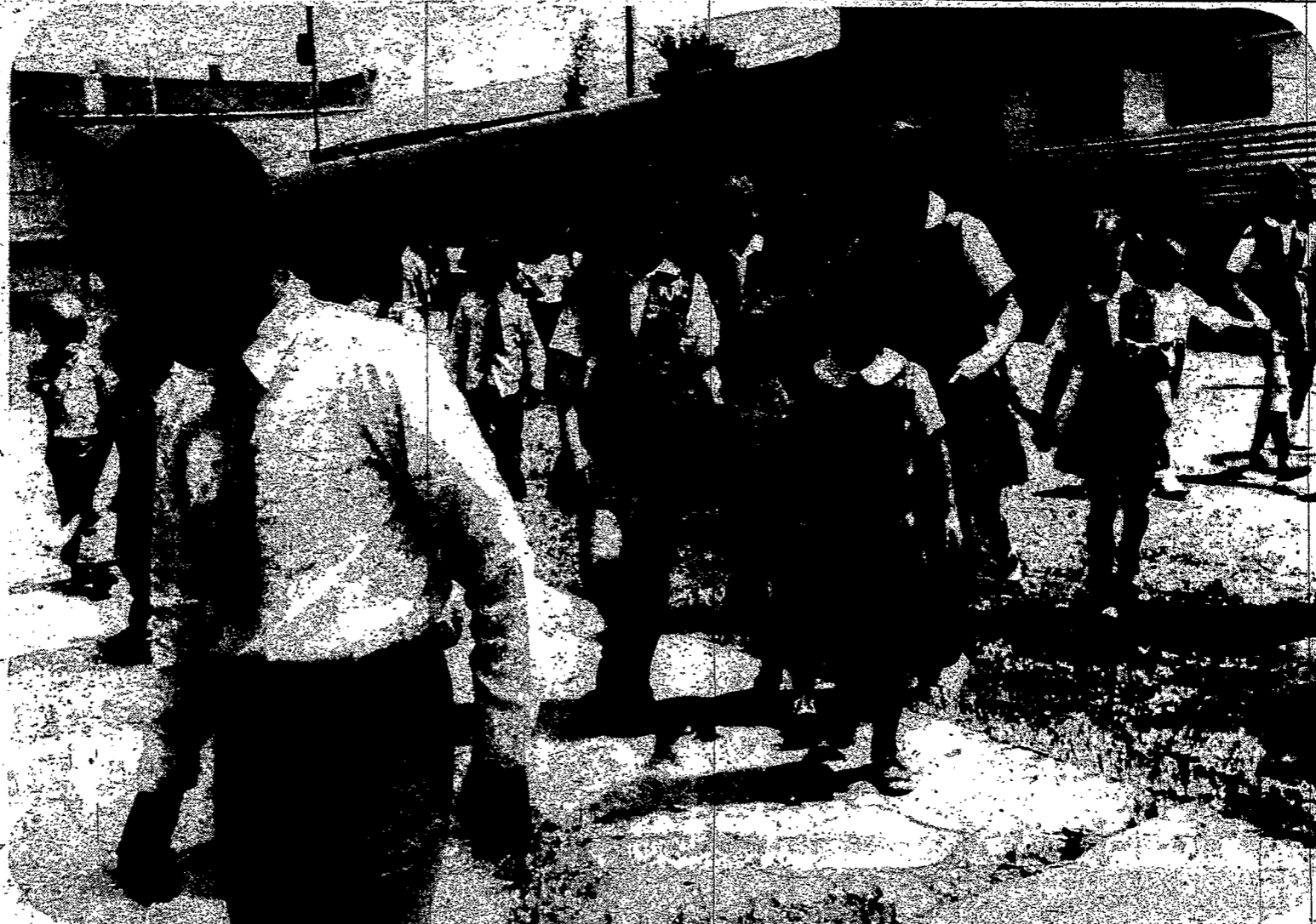
Children enjoy a tour of the railroad yard before returning to school.