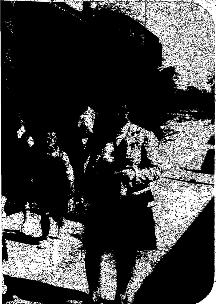
Students onto the train.