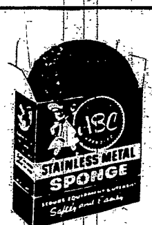
#94 s/s Sponge $ .60 each $6.50 doz.