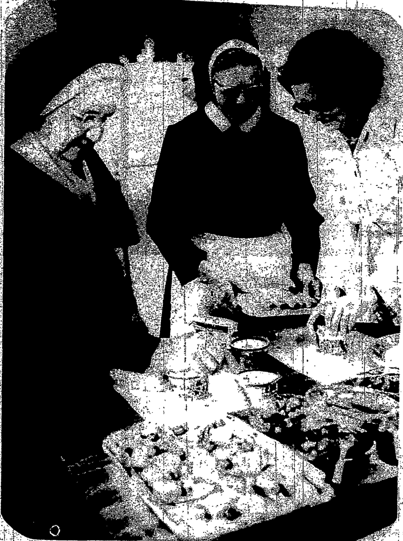
Big Day