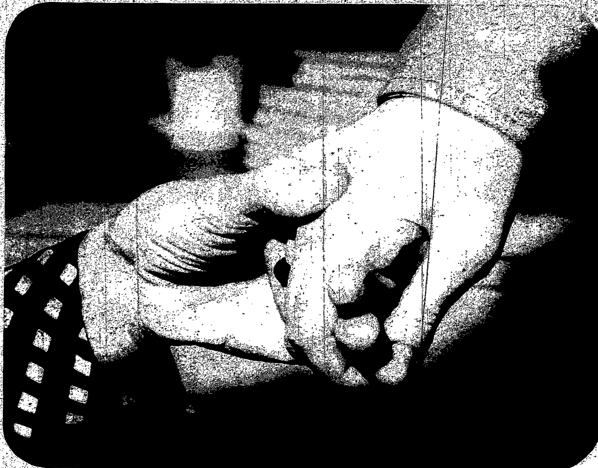
Friends bridge the generation gap