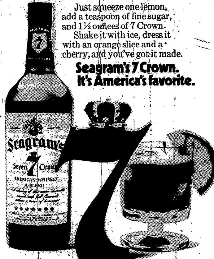
SEAGRAM DISTILLERS COMPANY, N.Y.C. AMERICAN WHISKEY — A BLEND, 86 PROOF.

Seagram's 7 Crown. It's America's favorite.